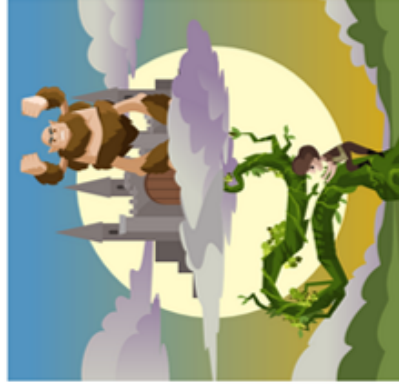
Enraged giant is getting ready to come down the beanstalk and wreak his revenge.